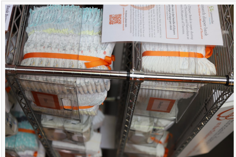
Diapers and supplies at the Monarch Diaper Bank

Greentrike is excited to announce that the Monarch Diaper Bank will open in the Children's Museum at JBLM on November 15, 2024. Greentrike is known for bringing playful experiences to families in their communities, from opening the first children's museum on a US military installation to launching a diaper bank to serve military families exclusively.