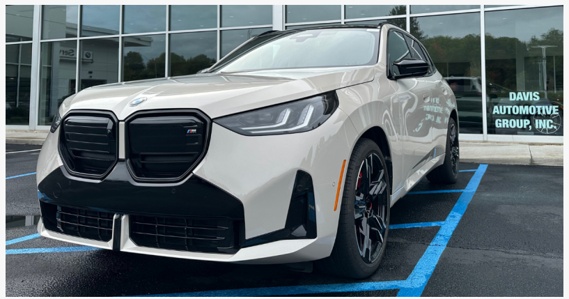
The 2025 BMW X3 M50 in Dune Grey at BMW Cleveland

Inside, the X3's cabin has undergone a transformation. The 2025 model features BMW's latest iDrive 9 system, offering seamless smartphone integration and a simplified control layout, making the driving experience more intuitive. The center console is cleaner and more refined, with fewer physical buttons and an elegant touchscreen interface. Optional ambient lighting and recycled polyester upholstery add a touch of eco-conscious luxury to the mix, balancing the car's tech-forward approach with its sustainability efforts.