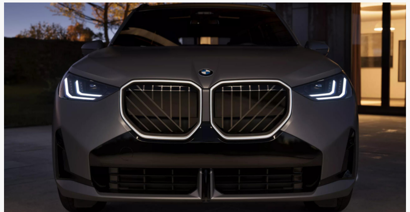
The 2025 BMW X3 Grille