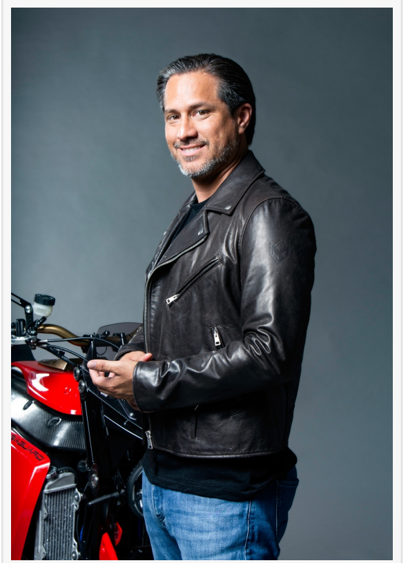
The Soriano Group is a benchmark for innovation in the manufacturing, engineering, automotive, entertainment, art, real estate, or finance sectors since 1903. It has recently introduced a range of limited-edition luxury EV motorcycles with a fully patente

2. Respecting Heritage and Craftsmanship: