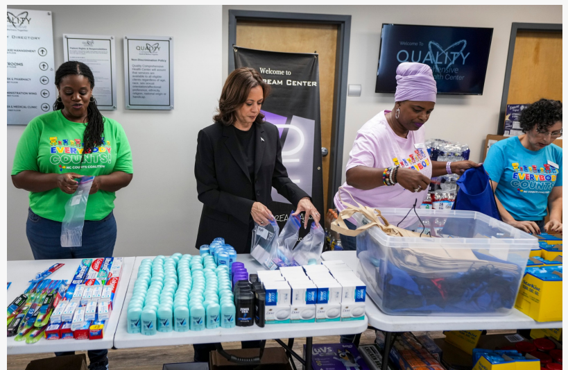
Democratic presidential nominee in U.S. Vice President Kamala Harris assists with care packages