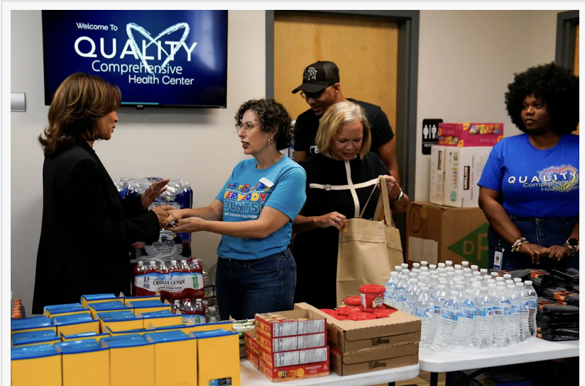
Democratic presidential nominee in U.S. Vice President Kamala Harris meets with volunteers assembling emergency eight packages, in the wake of Hurricane Helene at Quality Comprehensive Health Center Rapid Response Donation Site in Charlotte, North Carolina