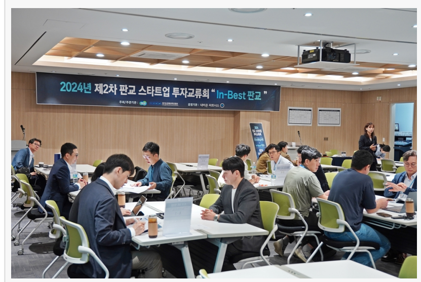
One-on-one consultations between investors and startups