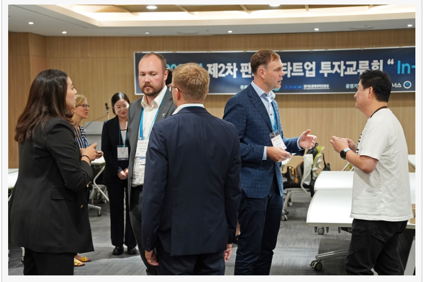
Scene from the Korea-Estonia exchange meeting

September 25th for three days, the event provided an essential platform for Pangyo startups to