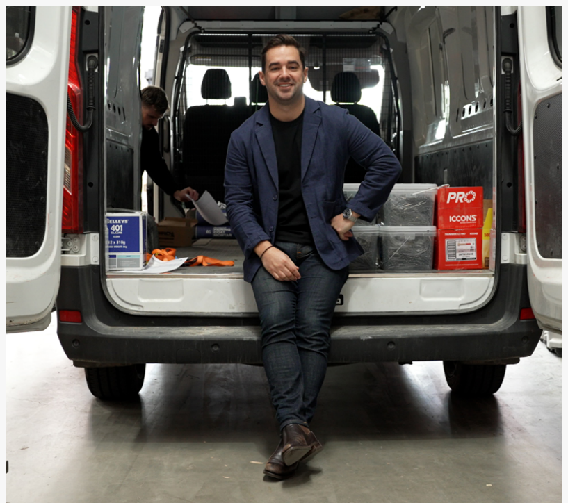
eDelivery platform will assist delivery companies to scale

“Secondly, eDelivery also includes a driver app that connects drivers and couriers directly to the web dashboard, creating a seamless flow of information and data. The app also has smart engines built in, which provides drivers with fastest route mapping and automated customer communications to create more efficient and transparent deliveries.