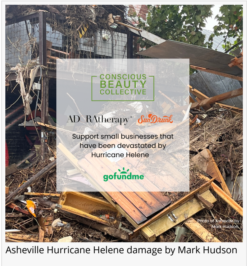
Asheville Hurricane Helene damage

ASHEVILLE, NC, UNITED STATES, October 7, 2024 /EINPresswire.com/ -- After Hurricane Helene struck Asheville, local wellness manufacturer and retailer, ADORatherapy, found itself confronting significant challenges as the city faced a devastating flood. While the company has been impacted, it has not lost hope, thanks to its supportive community and timely expansion into Miami. The Asheville store, though closed due to the flooding, is receiving support from the newly opened Miami location, which is continuing to fulfill orders and support the Asheville team during this difficult time.