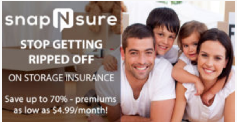
renters insurance for storage unit