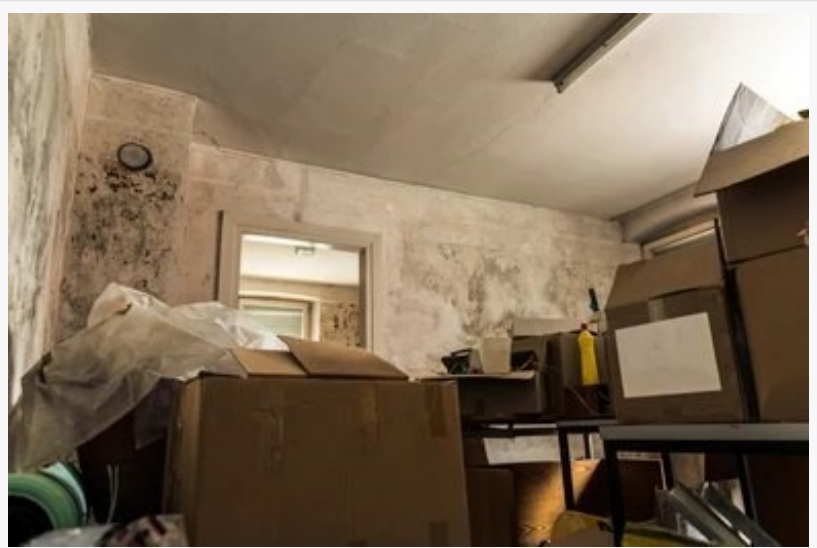
renters insurance Georgia