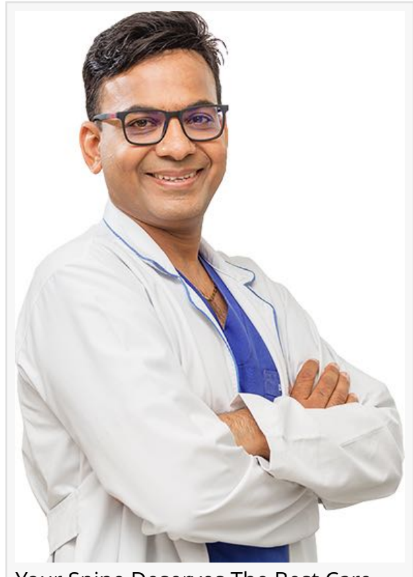
Your Spine Deserves The Best Care Let Us Help You Live Your Life To The Fullest

IndoSpine's recent acquisition of the O-arm<sup>®</sup> O2<sup>®</sup>