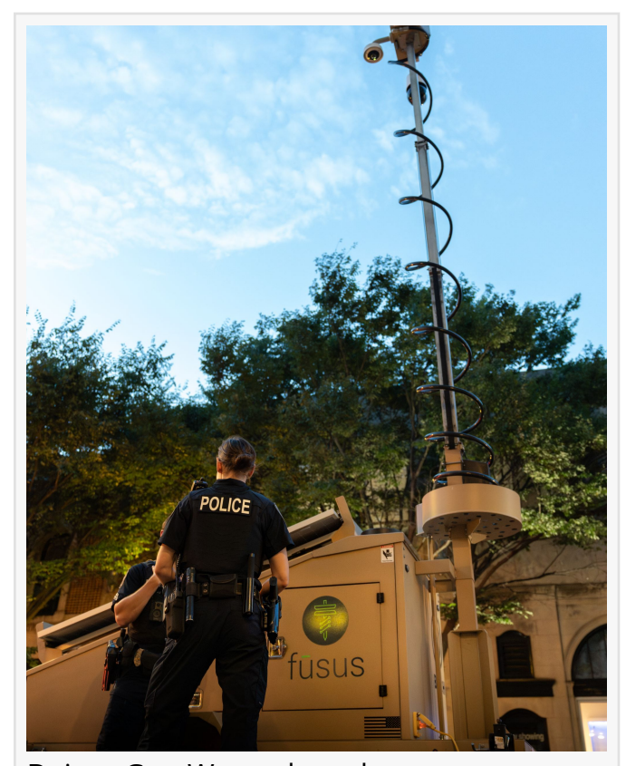
Dejero GateWay onboard a FUSUS/Compass Security Solutions mobile surveillance trailer equipped with hi-res cameras at a crucial area in downtown Winston-Salem

"As we move forward, we're exploring Dejero's unique connectivity solutions for a range of applications as part of our Drone First Responder (DFR) program," Lt. Jones continues. "Deploying Dejero units in spots that don't have a hard-wired