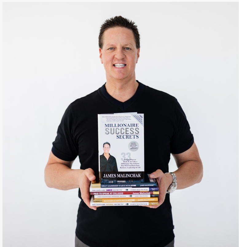
James Malinchak, Author of 30+ Books

This press release can be viewed online at: https://www.einpresswire.com/article/749751002