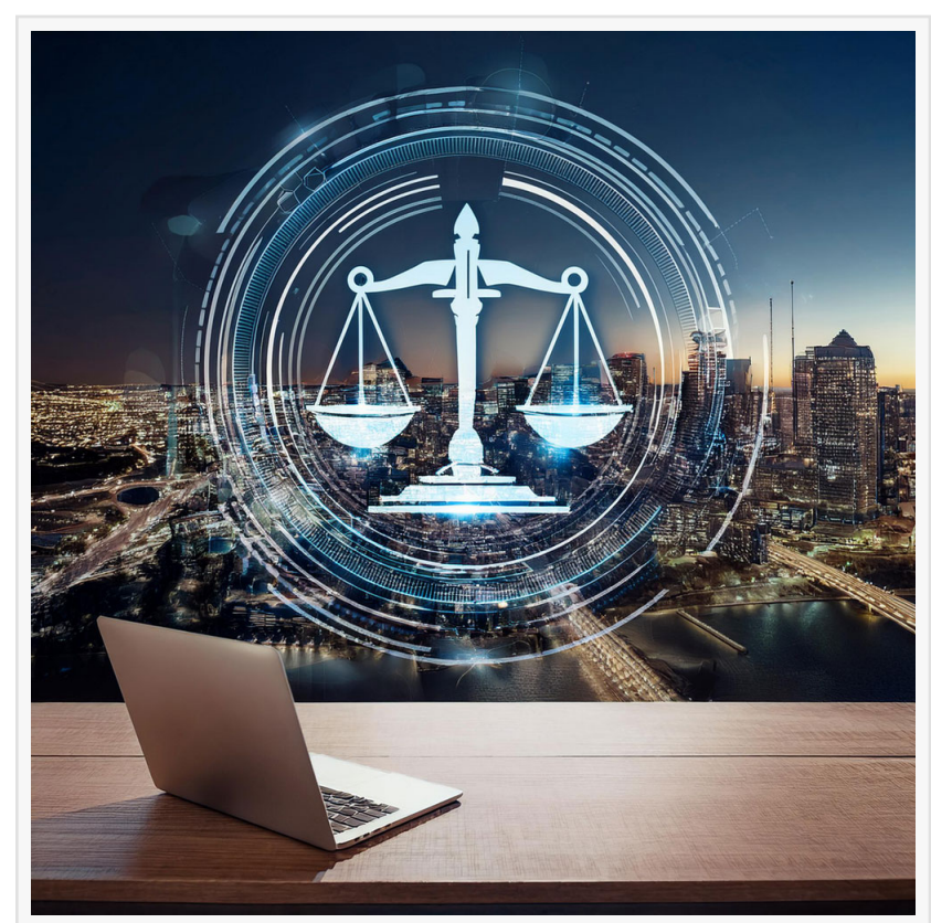
At Slingshot Legal Support, our in-house call centers vet claimants for diverse mass tort cases, saving you the hassle.

sign documents, establishing an indisputable record of their claim's validity.