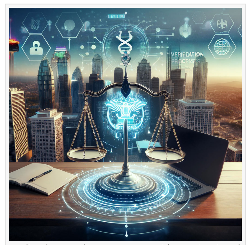
At Slingshot Legal Support, we provide top-tier signed retainers for diverse mass tort cases. We strive for excellence, delivering high-quality claimants to your law firm.

Our platform is designed to handle large volumes of leads, making it suitable for law firms of all sizes. Whether you're a small firm or a large legal team, Slingshot Legal Support ensures that you receive the highest quality leads without sacrificing integrity.