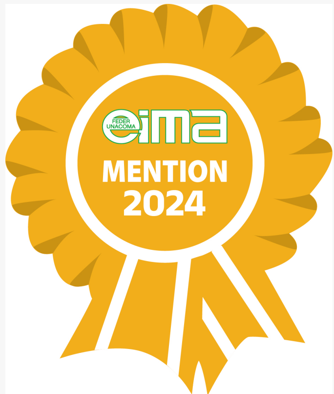
EIMA international Technical Innovation Award 2024 given to MDB Srl, Oranfresh and Vision Global Service