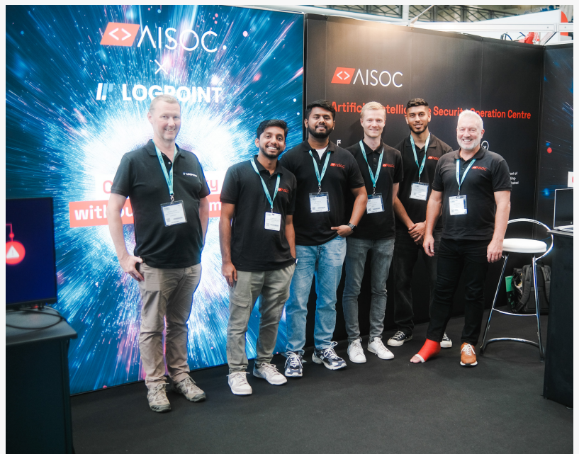
AISOC Team at ICE 2024.

AISOC user dashboards are compatible with all devices, enabling seamless access to data anytime, anywhere.