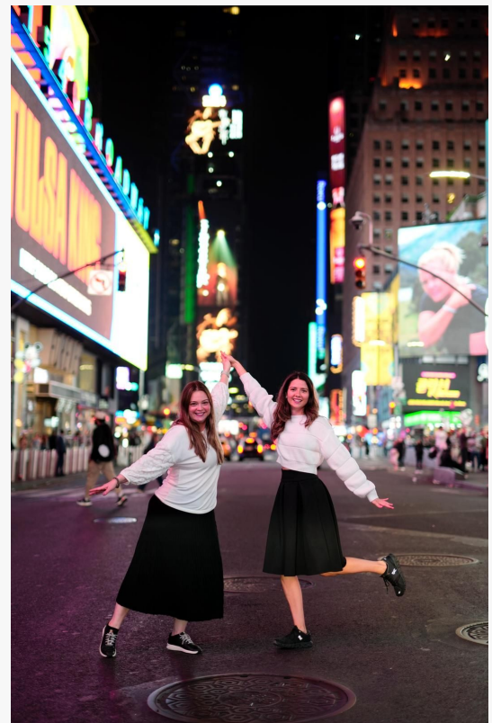
Partners in Crime