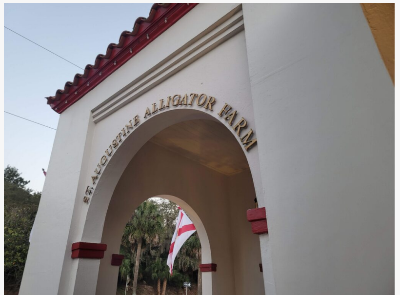
Gator Farm in St Augustine