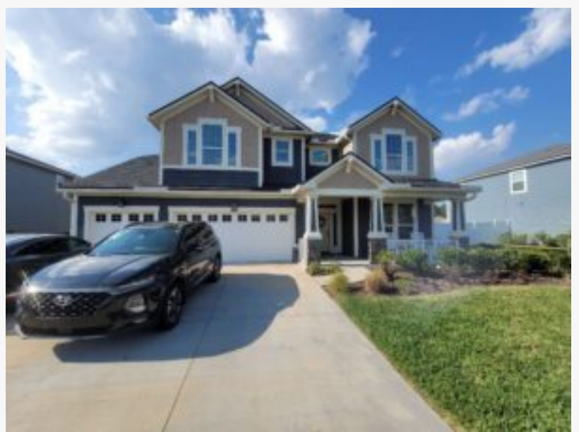
Exterior Painting in St Augustine

At Three Peaks Painting, everything revolves around three core values: Quality, Service, and Production. These guiding principles not only set the company apart but also help ensure that every project is executed with the highest standards of professionalism and care. The company's new website and branding are both visual representations of these values.