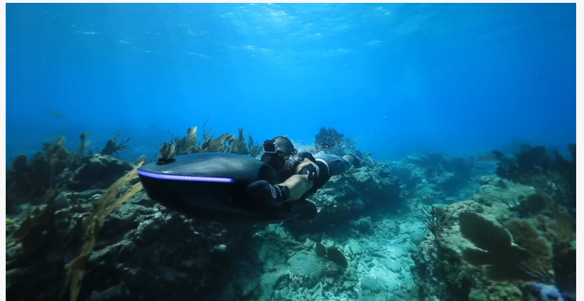
A diver exploring a coral reef using the lightweight SeaNXT Elite underwater scooter with a sleek carbon fiber design.