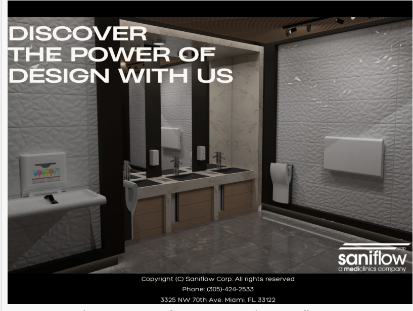
Discover the Power of Design with Saniflow Corp.