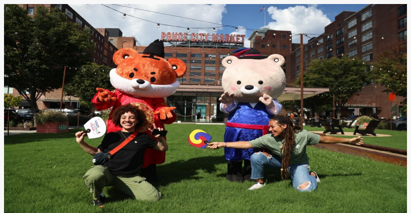
Attendees pose with mascots in traditional Korean attire at the "Experience Korea" event in Ponce City Market