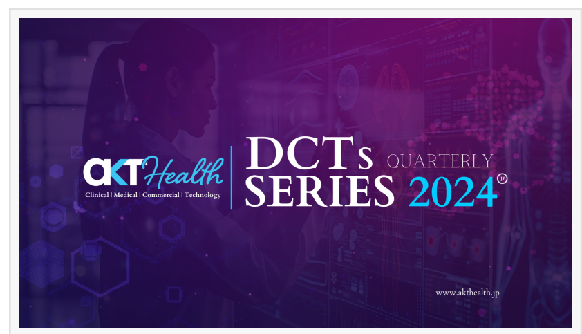
Decentralized Clinical Trial Quarterly Series 2024: Japan

TOKYO, JAPAN, October 11, 2024 /EINPresswire.com/ -- In an era where healthcare is rapidly evolving, the introduction of <u>Decentralized clinical trials (DCTs)</u> marks a pivotal shift in how clinical research is conducted. Recognizing this transformative trend, <u>AKT Health</u> is excited to announce the launch of the DCTs Quarterly Series