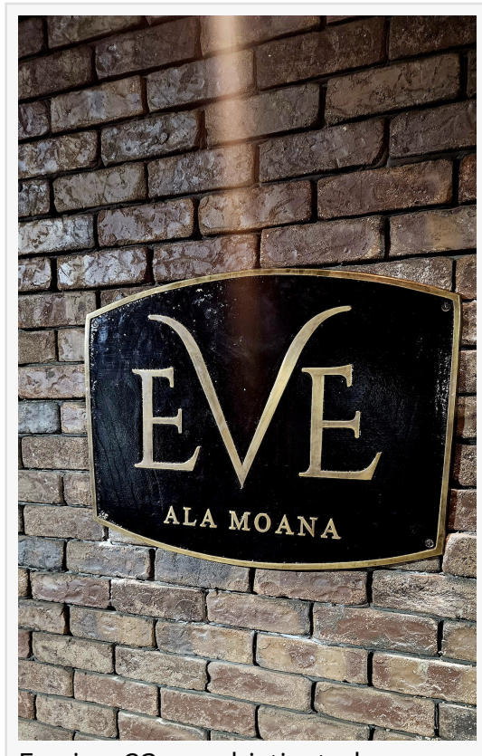
Eve is a 23+ sophisticated nightlife venue and event space for up to 400 guests

This press release can be viewed online at: https://www.einpresswire.com/article/750308170