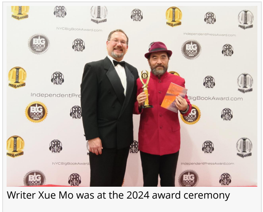
Writer Xue Mo was at the 2024 award ceremony

During an engaging interview session, hosts expressed their deep admiration for Xue Mo's literary spirit. In "Into the Desert," he narrates a compelling story featuring main characters Lanlan and Ying'er that underscores humanity's resilience to pursue dreams amidst adversity. The narrative encourages readers to hold steadfastly to their aspirations without surrendering—even when faced with formidable challenges—promising that they will eventually witness dawn breaking after darkness.