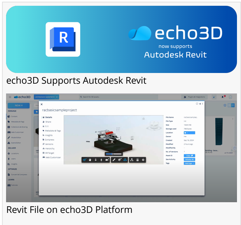
echo3D Supports Autodesk Revit

NEW YORK, NY, UNITED STATES, October 15, 2024 /EINPresswire.com/ -- During this year's Augmented Enterprise Summit conference in Dallas, echo3D , a leading provider of 3D digital asset management solutions, announced it now supports Autodesk Revit files. This milestone signifies echo3D's commitment to streamlining the 3D workflows of teams working on 3D projects in all industries, including architecture, engineering and construction (AEC).