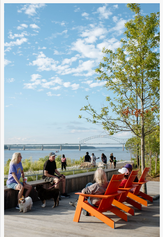
The Memphis riverfront offers serene spaces to enjoy views of the Mississippi River