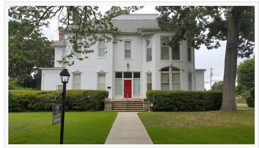
The Gaines House in Little Rock, Arkansas.

For dessert, guests will enjoy a selection of decadent options alternating between: