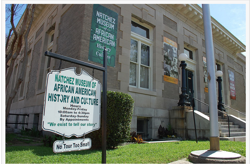
The African American Museum of History and Culture contains exhibits from a number of Natchez related African American historic sites, important citizens and events.

"NAPAC museum and the Civil Rights Trail Committee have done a great job with this publication," she said. "The goal was to give our residents and visitors a convenient pocket guide for self-guided tours that is user-friendly, easy to follow, and easy to share with others. I think they accomplished that goal."