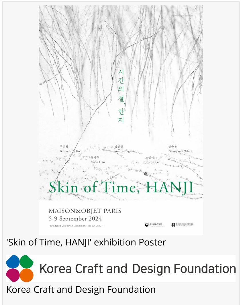
'Skin of Time, HANJI' exhibition Poster

Im Yewoon K-Culture Diffusion Bureau +82 2-398-1667 email us here