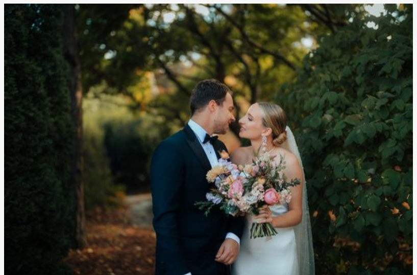
bridal makeup specialist lake lure