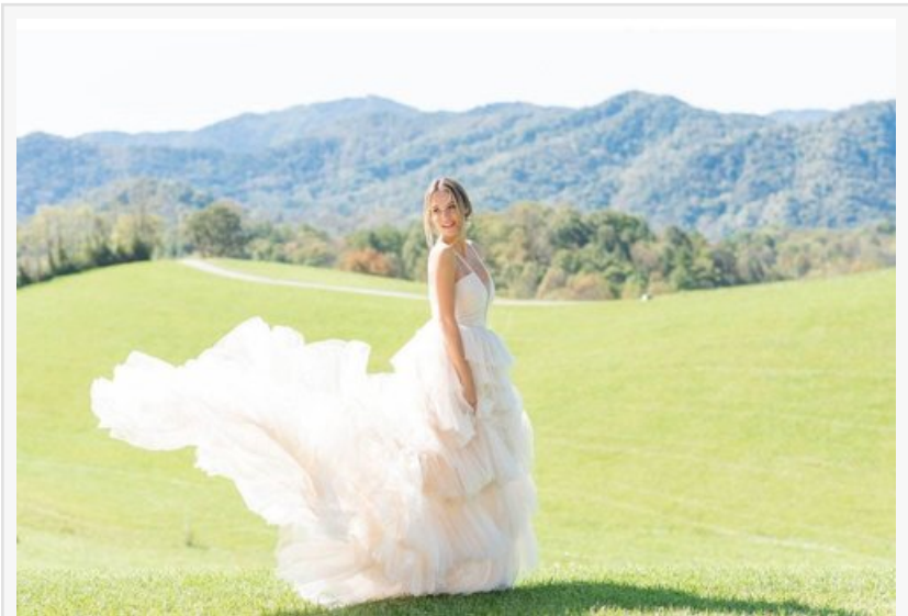
hair and makeup -asheville nc

Natural bridal makeup enhances a bride's features while maintaining a radiant, glowing appearance. Using lighter formulas, professional artists create a long-lasting, soft look that's perfect for photos and real life. Asheville brides prefer this approach to feel like the best version of themselves, embracing subtle contouring and soft highlighters for a fresh, natural glow.