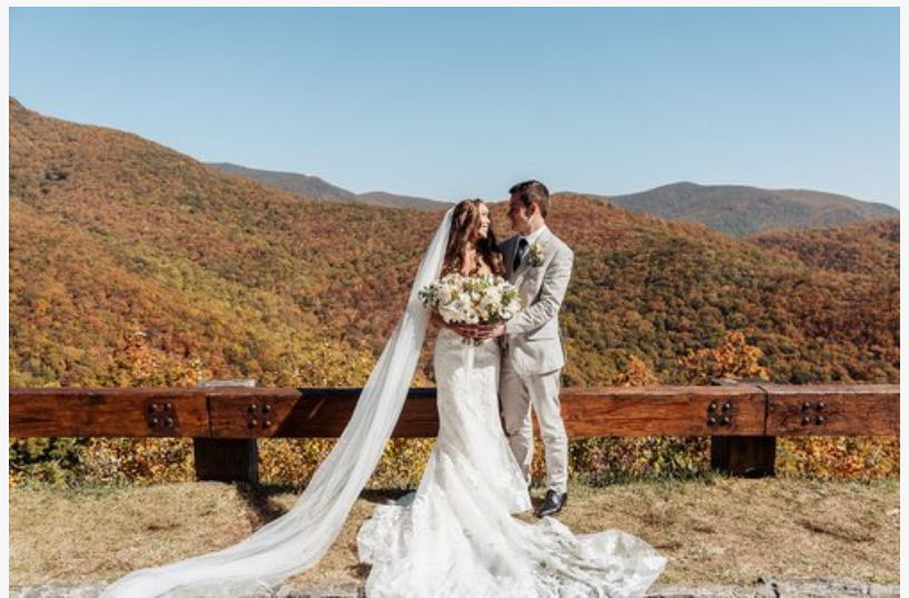
wedding hair stylist- in weaverville nc