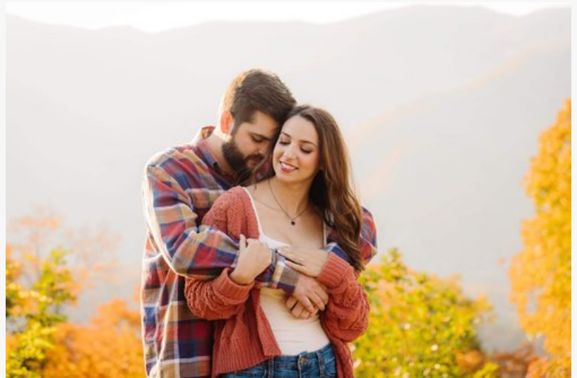
Asheville hair & makeup artist