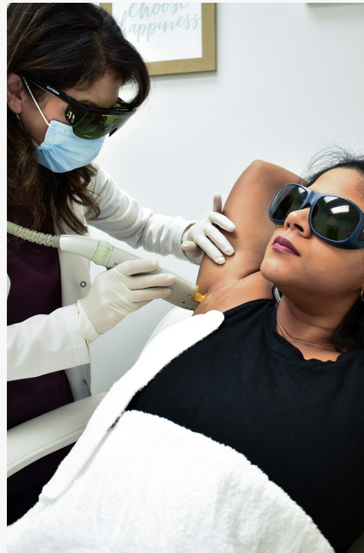
SkinSuite-Laser Hair Removal