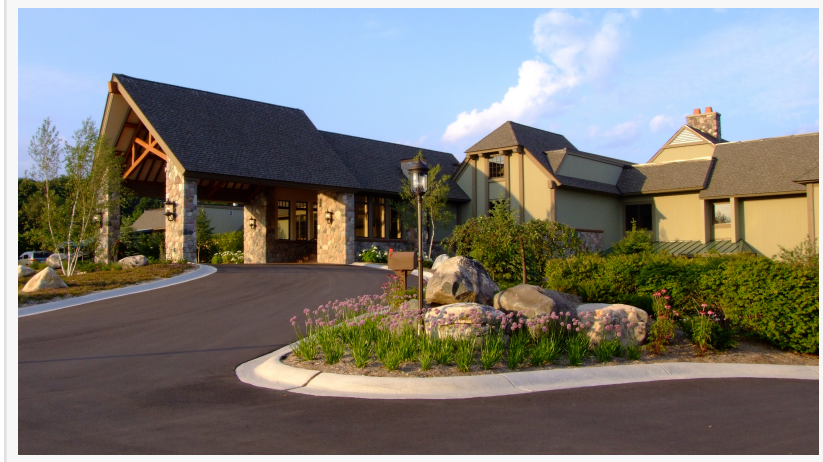
Birchwood Golf & Country Clubhouse