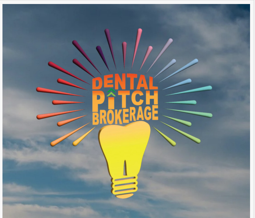
Dental Pitch Brokerage Logo

This press release can be viewed online at: https://www.einpresswire.com/article/750674661