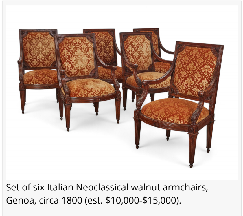
Set of six Italian Neoclassical walnut armchairs, Genoa, circa 1800 (est. $10,000-$15,000).