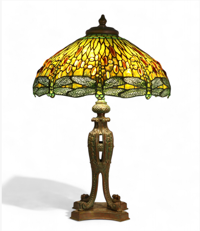
Circa 1910 Tiffany Studios leaded glass and patinated bronze 'Drop-Head Dragonfly' table lamp (est. $40,000-$60,000).

Aileen Ward Andrew Jones Auctions +1 213-748-8008 email us here