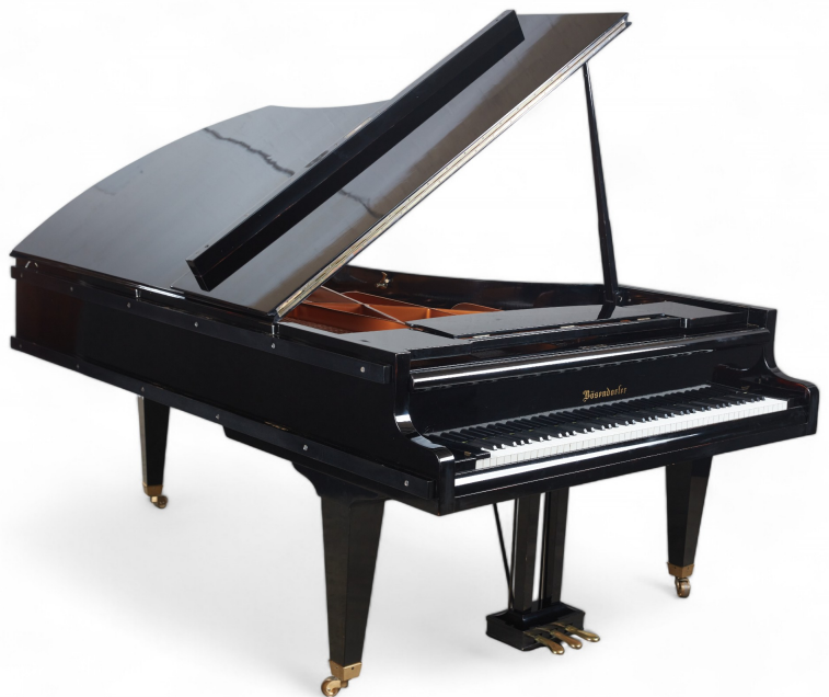
Bosendorfer ebonized grand piano with 92 keys, 20th century, 7 feet 4 inches (est. $20,000-$30,000).