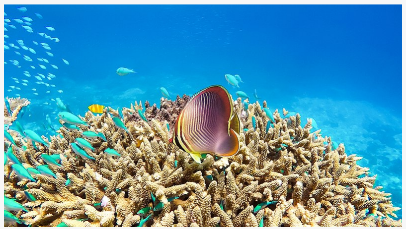
Tourists earn rewards while safeguarding the Great Barrier Reef via the new Guardian of the Reef program.