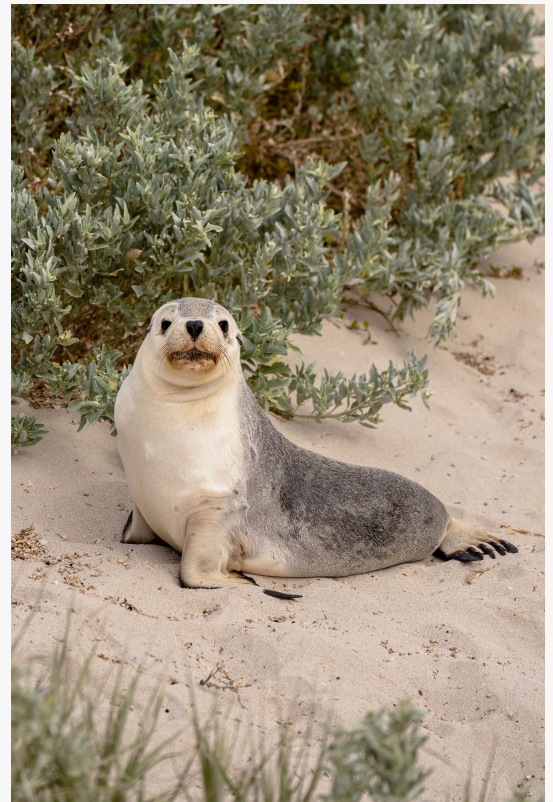
On Kangaroo Island In South Australia, guided tours fund essential research for endangered sea lions.

Seattle, Washington: Seal Sitters is a grassroots organization that protects marine wildlife, particularly harbor seal pups, on crowded beaches. On-call volunteers sit with seals as they nap to protect them from unwanted interference, educate the public about responsible behavior around wildlife, and contribute valuable data on marine health and pollution to researchers. This initiative fosters a sense of stewardship for the environment.