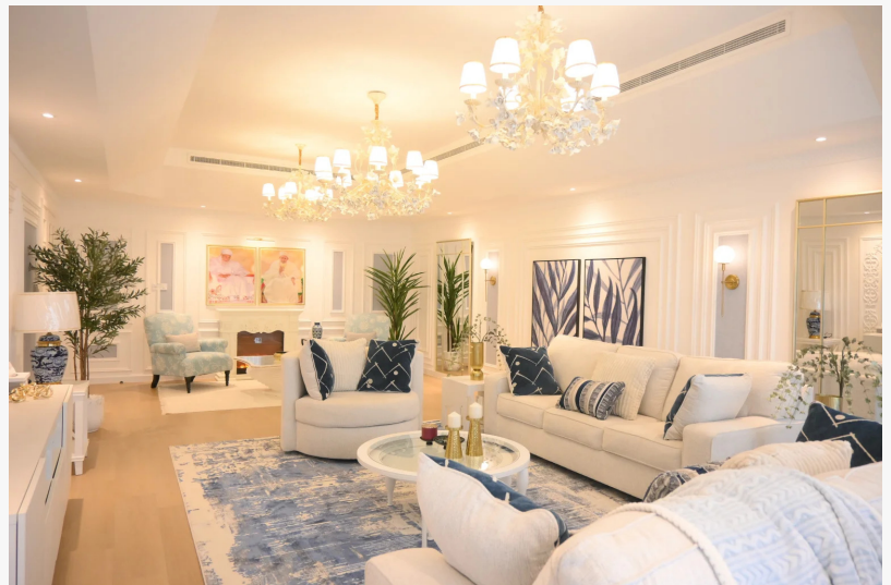
Residential Interior Design