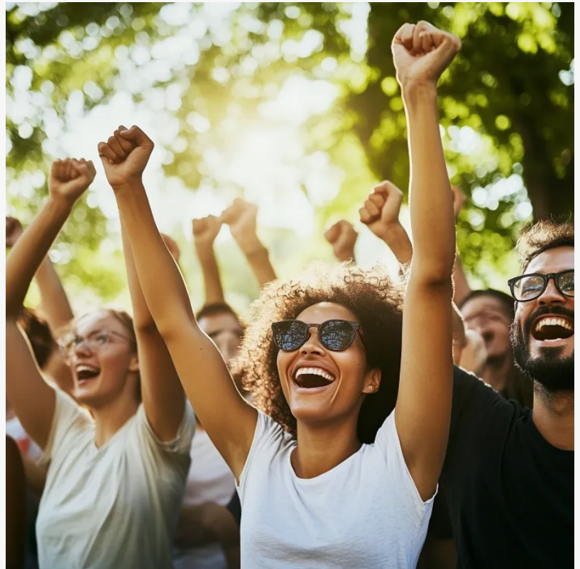
Business owners cheer about FinCEN Guidance's secure BOI report filing & submitting