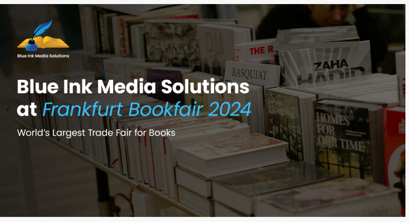
We look forward to seeing you there and celebrating this year's Frankfurt Book Fair!

Blue Ink Media Solutions is bringing global talent to the spotlight at Frankfurt Bookfair 2024. Join us for an unforgettable showcase!