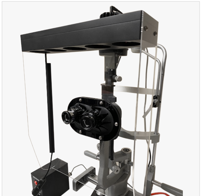
Najafi-Osher Slit Lamp Barrier Shield