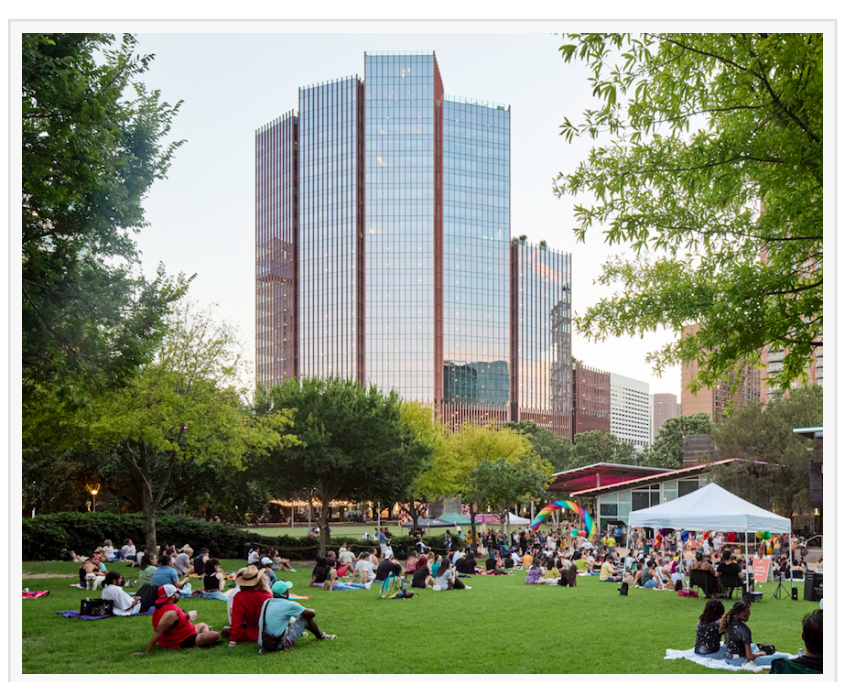
View from Discovery Green Park

The distinction for the trophy tower, which is located on Discovery Green park and recognized as one of Houston's most sustainable office buildings, marks the 12th Platinum certification of a Skanska-developed project in the United States – joining notable developments such as 2+U in Seattle, WA, 121 Seaport in Boston, MA, plus Beverly Hills' first LEED Platinum office building 9000 Wilshire.