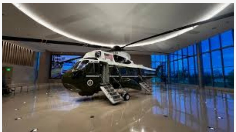
Marine One Helicopter in the 4141 Locomotive Pavilion at the Bush Library in College Station, TX where the town hall will take place

Marine One/4141 Locomotive Pavilion adjacent to the George & Barbara Bush Presidential Library on the campus of Texas A&M University in College Station, TX. "Why We Serve...Or Don't" will be the sixth in a series of ongoing town halls that have taken place across the country since the beginning of this election year, and will continue into the new year.