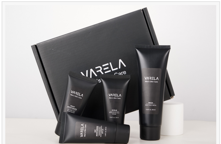
VARELA Premium 4pc Men's Skin Care Set