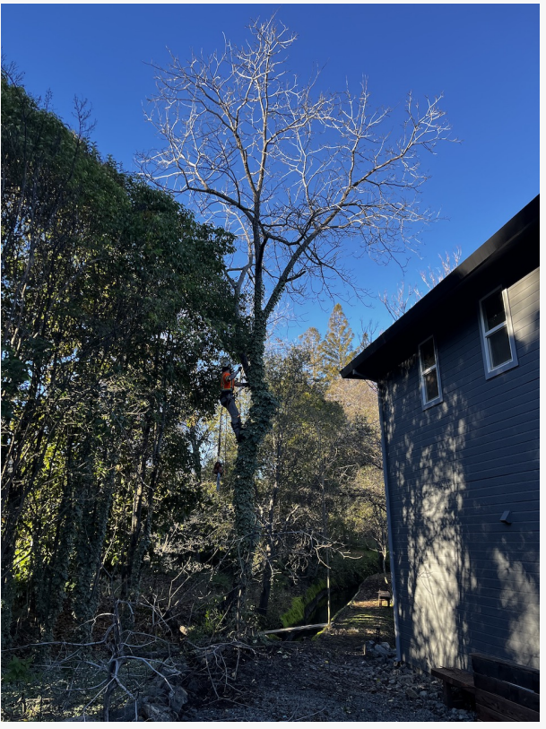
Tree Removal Auburn Ca

About Us Section: A detailed narrative of the Lund brothers' journey and the company's mission, emphasizing their deep connection to the local landscape.