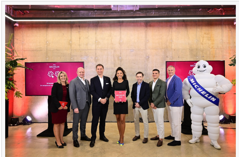
Michelin 2 Key Thailand

The MICHELIN Guide also emphasizes the individuality and authenticity of InterContinental Phuket Resort. The property's ability to offer an authentic connection to Thai culture while providing modern luxury makes it a standout destination in the global hospitality market. Every guest is offered a personalized experience that reflects the resort's unique identity, whether it is through the locally sourced sustainable cuisine at the award-winning and MICHELIN Guide Jaras