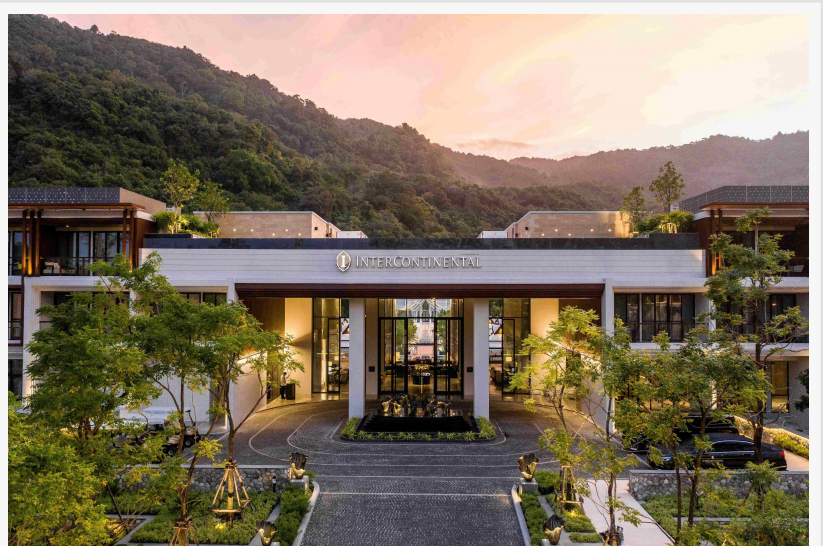
InterContinental Phuket Resort

for its world-class service, architectural brilliance, and commitment to providing guests with memorable, personalized experiences. The MICHELIN Keys are a global benchmark for outstanding hotels and now recognizes InterContinental Phuket Resort as one of the top-tier