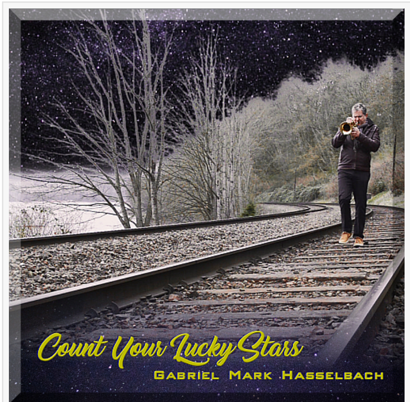
Best Contemporary Album: Thirteen divinely inspired tracks, full of texture and color