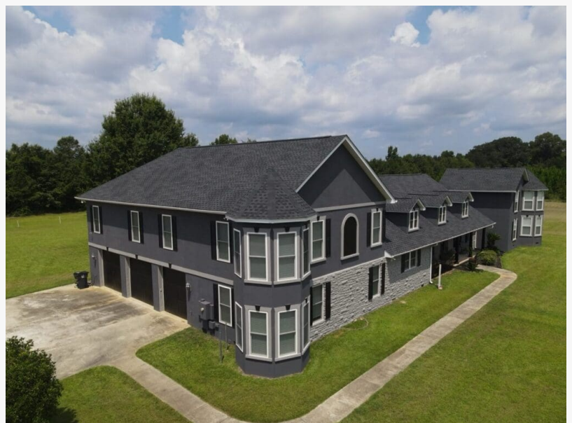
Exterior Painting Warner Robins