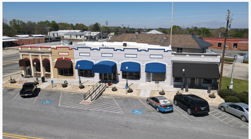
Commercial Painting Warner Robins