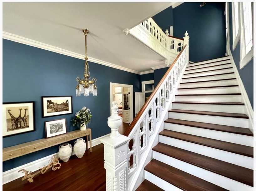
residential painter warner robins