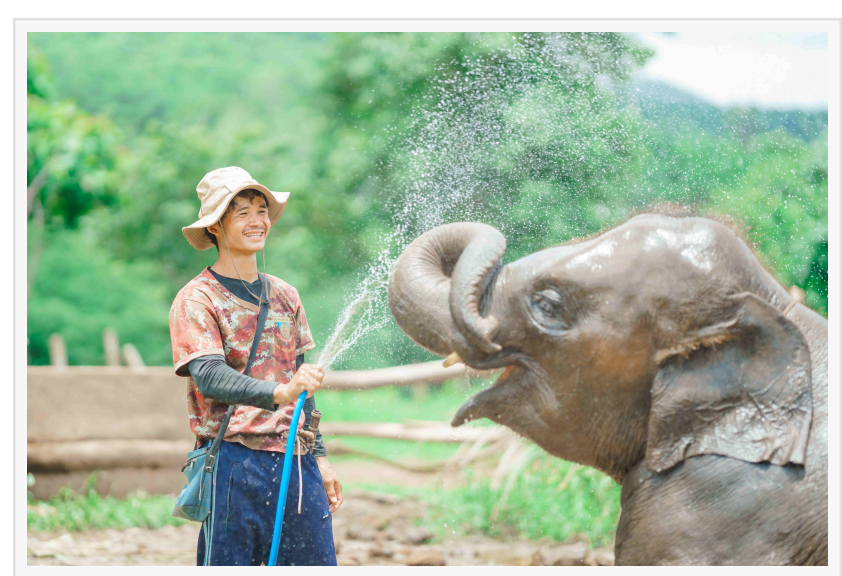
Elephant Mahout Hydrating Elephant

The <u>Elephant Freedom Project</u>, one of the most highly regarded and ethical elephant sanctuaries in Chiang Mai, is proud to announce that it has