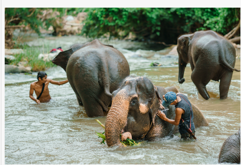
Mahout Elephant Bathing In River