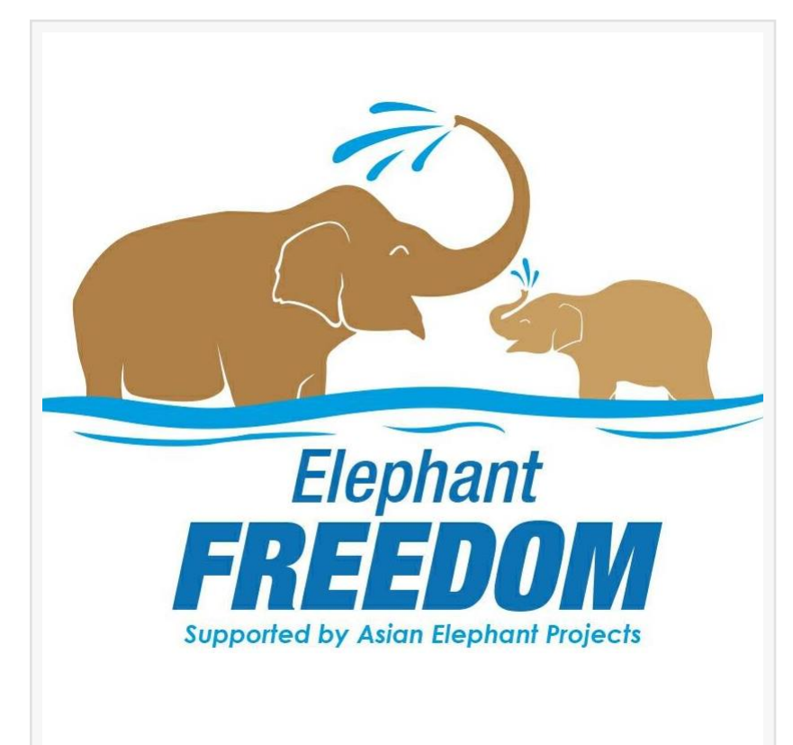
Elephant Freedom Project Logo