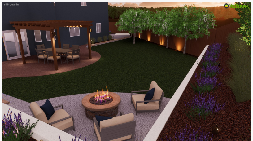
3D Landscape Rendering