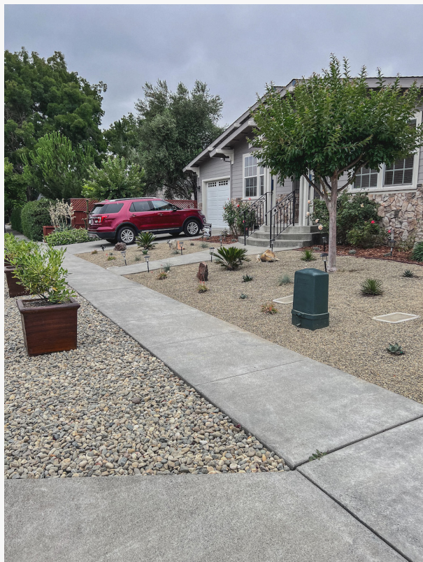
Landscape Build and Design Napa Valley