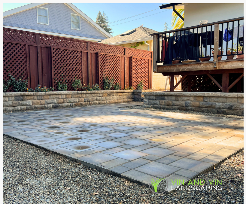
Paver installation Napa Valley

Accountability: The company takes pride in its work, holding itself accountable at every stage of a