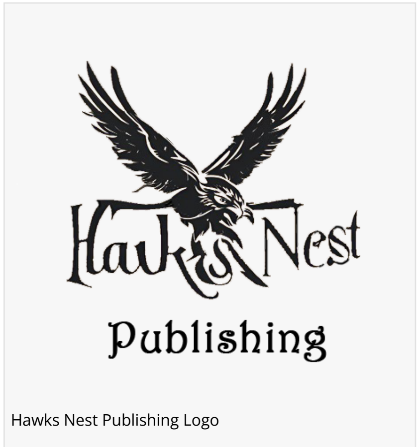
Hawks Nest Publishing Logo