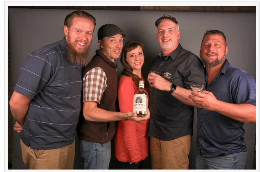
Tequila Mezcal Judges with 2023 Best of Show-1st Place Winner

Wine Country Network, Inc. was established in 2002. Our company publishes Wine Country International <sup>®</sup> Magazine and the World Book of Whisky magazine.