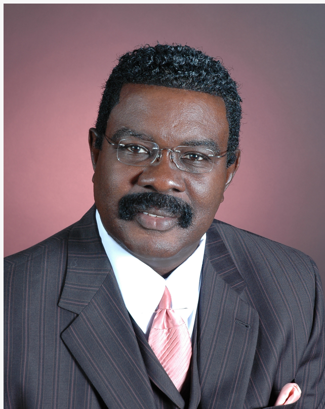
NVBDC Board of Directors

FIND US | LIKE US | FOLLOW US | JOIN US: LinkedIn, Facebook, Twitter, Instagram, and RallyPoint