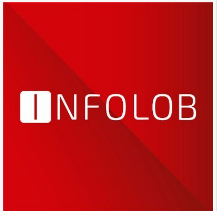
INFOLOB GLOBAL, INC.

Oracle PartnerNetwork, delivering Oracle Cloud Infrastructure (OCI) services including Oracle Exadata as well as Oracle Fusion Cloud Applications Suite managed services. By collaborating with Oracle, Infolob's strong talent pool has gained OCI expertise with more than 800 certifications and is committed to customer success by delivering